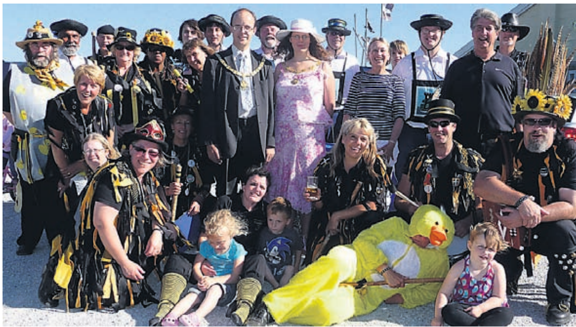
Surrounded by blue skies they marched off in force to Launch a 1000 Ducks

But Needs your Support for the Next Eighteen Years