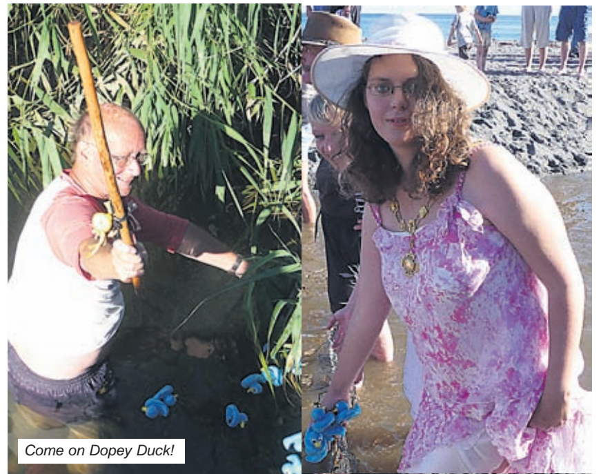
Come on Dopey Duck!