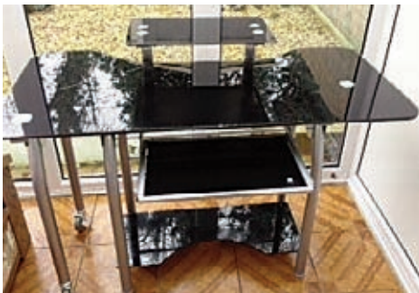
Desk top swivels on wheels to make L-shape

This desk can be used either L-shaped or closed to save space, with a pullout keyboard