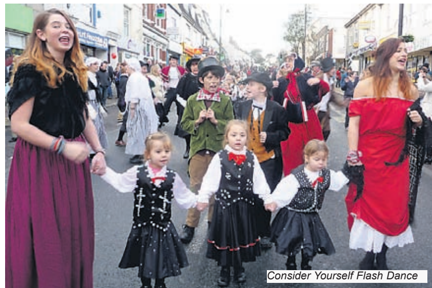
Consider Yourself Flash Dance

Then, following a dramatic countdown, the town's Citizen