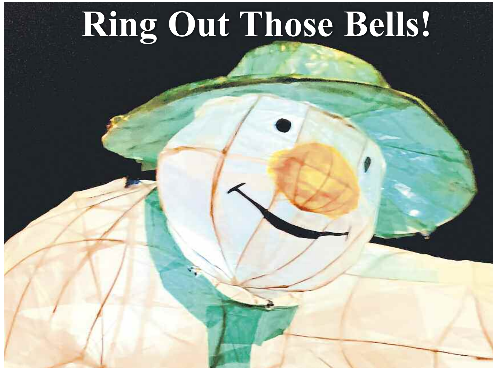
The bells of the Church of St Nicholas and St Faith rang out for the lanterns this year, ushering in the 10th annual Saltash Lantern Parade.