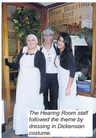
The Hearing Room staff followed the theme by dressing in Dickensian costume.