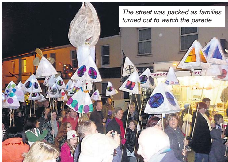
The street was packed as families turned out to watch the parade