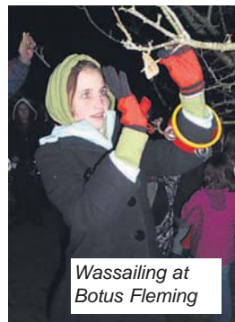
Wassailing at Botus Fleming

Less cheerful news was the reducing of library opening hours as part of Cornwall's cost cutting. We