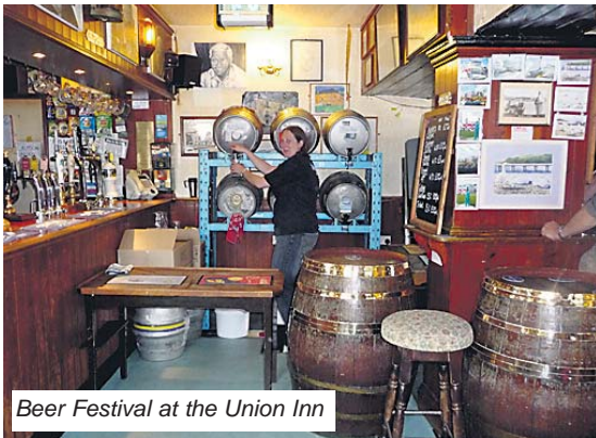
Beer Festival at the Union Inn

The good news which we were delighted to report was