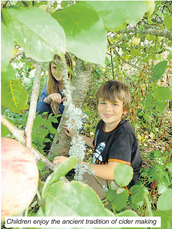
Children enjoy the ancient tradition of cider making

Britain will host the Olympic games and the Olympic torch will pass through Saltash on the first stage of its journey from Lands End, crossing to