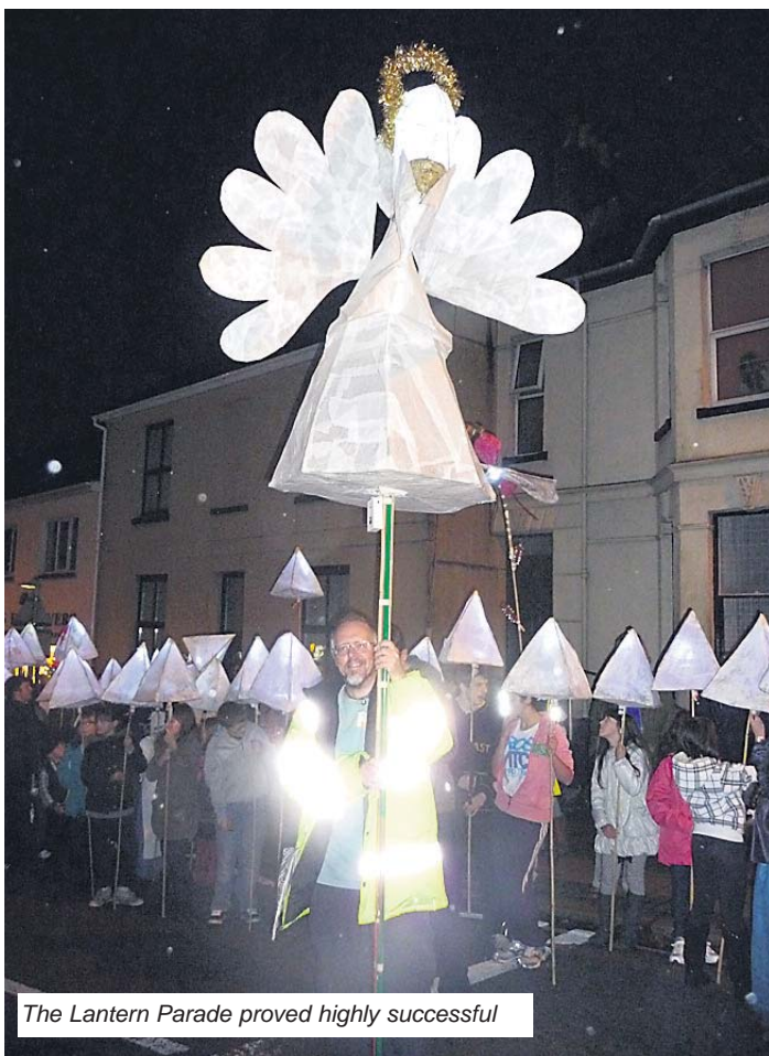
The Lantern Parade proved highly successful

Now visit.... www.saltash-observer.co.uk