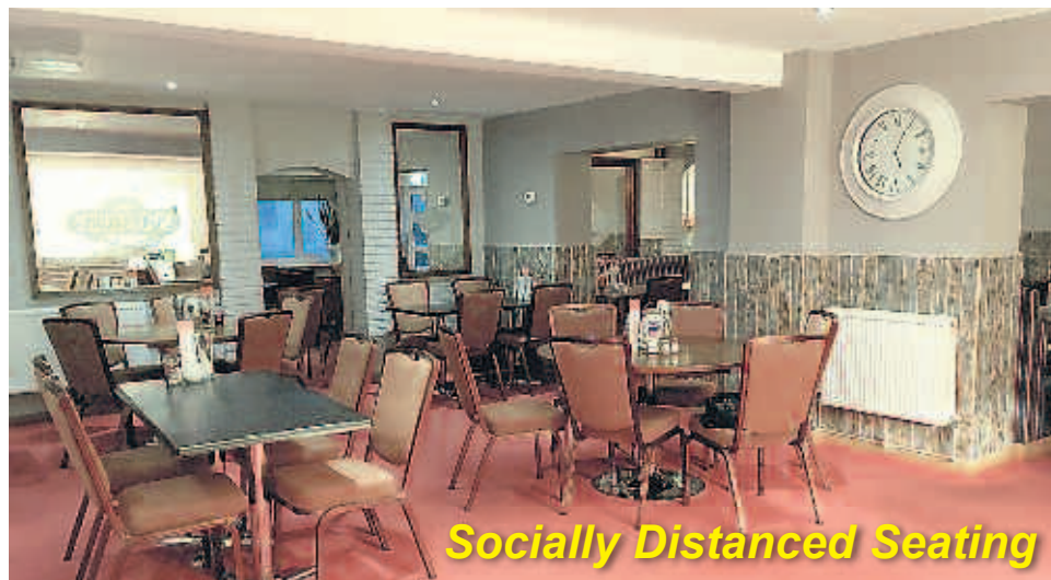
Socially Distanced Seating