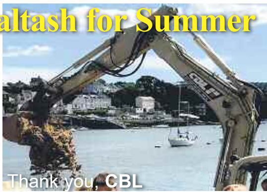
Thank you, CBL

To coincide with the arrival of the sand Saltash Scrapstore is running a sand castle