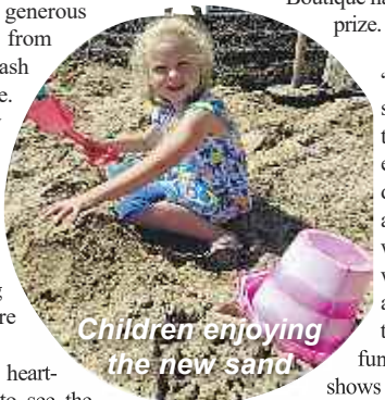
Children enjoying the new sand

competition and encouraging families to upload a photo or selfie to their Facebook page by 31 August. Local Truly Scrumptious Sweet Boutique has donated the prize.