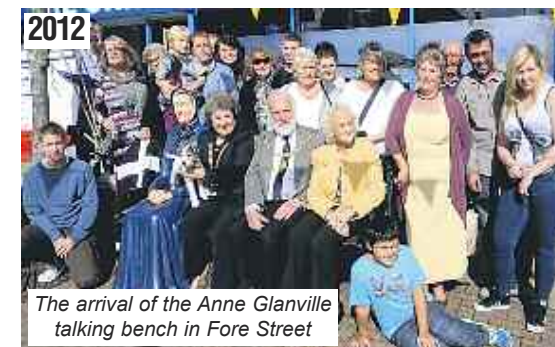
The arrival of the Anne Glanville talking bench in Fore Street