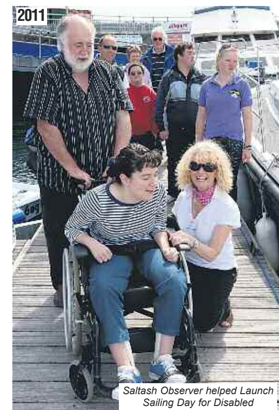
Saltash Observer helped Launch Sailing Day for Disabled

years from 5th anniversary through to 25th year; including one of the best attended local quizzes and fun nights arguably ever seen in the area. Amusingly, I recall at one such fund-raising event Mary had to stop at 310 people as the venue had run out of usable space and seating; yet despite that, dozens more people were queuing to come in, hoping to acquire a last seat in the house. People wanted so much to support Mary's fund raising efforts! A joy to behold! Pleasingly, all the paper's Anniversaries have been