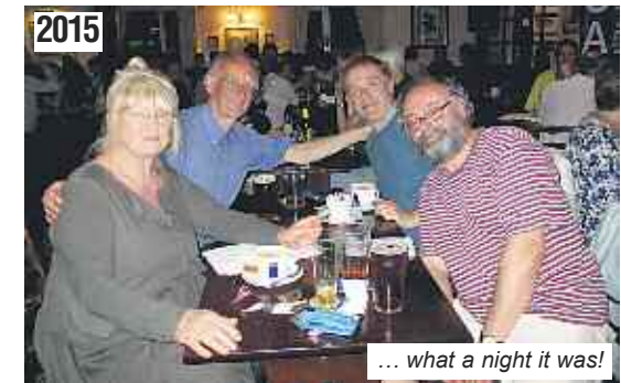
... what a night it was!