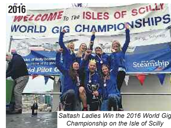
Saltash Ladies Win the 2016 World Gig Championship on the Isle of Scilly