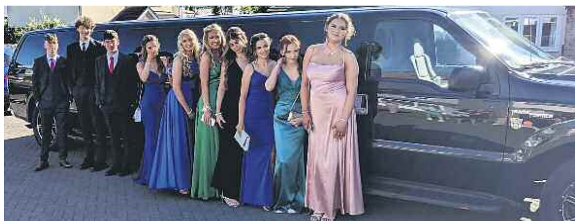
Students from Saltash Community School celebrate in style after finishing their GCSE exams.