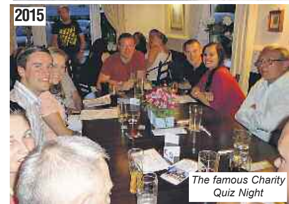
The famous Charity Quiz Night