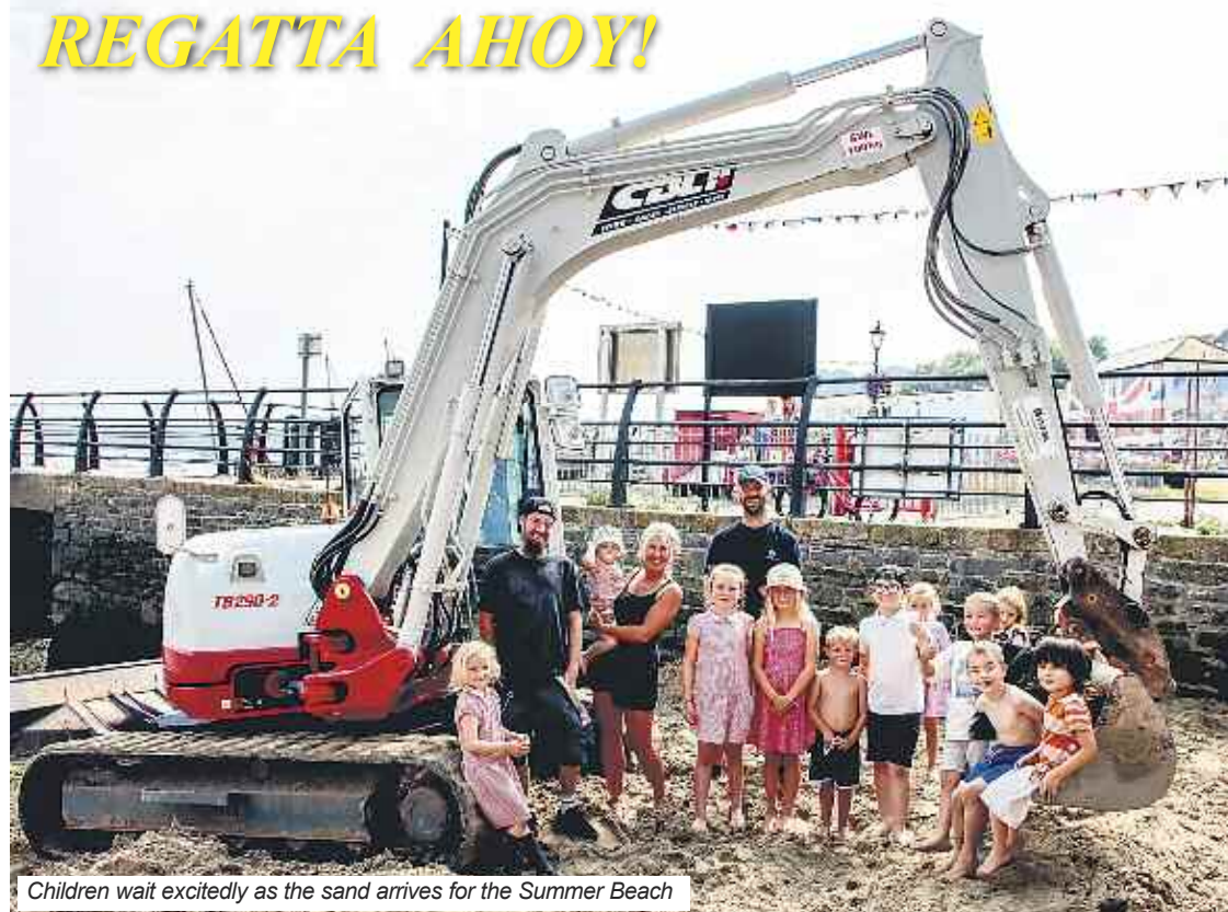
Children wait excitedly as the sand arrives for the Summer Beach