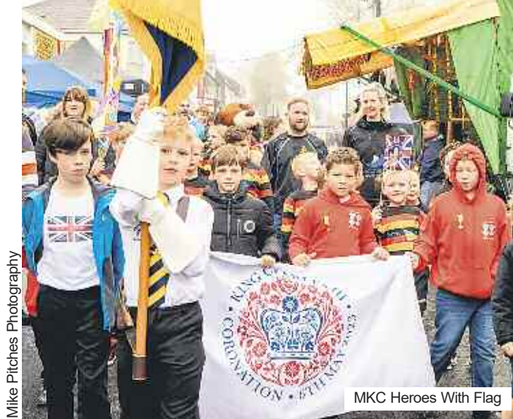
MKC Heroes With Flag