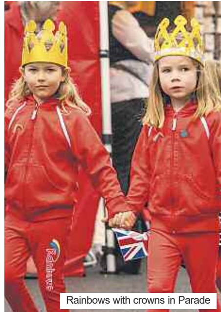
Rainbows with crowns in Parade