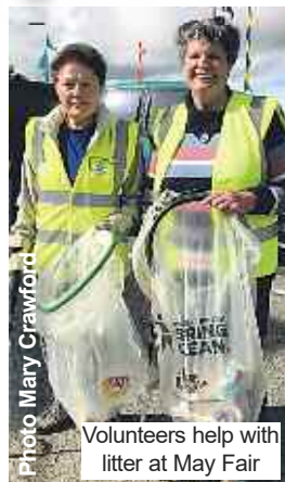
Volunteers help with litter at May Fair