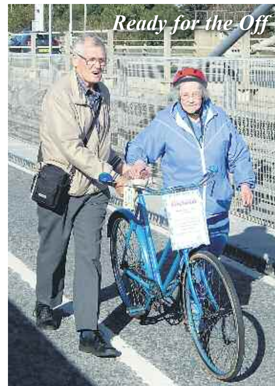
Ready for the Off

The ATM would be closed together with the bank in early December, the reason being that there are three others close by. The bank would seek to market its lease on the building once it is empty and there is already interest shown in taking on the lease so that this will not, it is hoped, be another empty building in our prime shopping street.