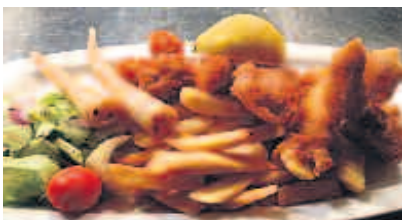
Filo Prawns, Scampi, Calamari & Beer Battered Cod Strips Homemade Tar Tare Sauce